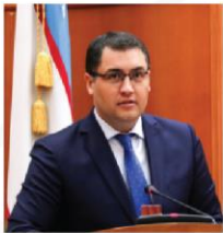
Mr. Ruslanbek Davletov , Minister of Justice of Uzbekistan