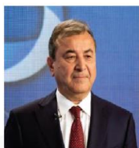
Mr. Sodiq Safoev , the First Deputy Chairman of the Senate of the Oliy Majlis of Uzbekistan

Mr. Safoev is an Uzbek diplomat and politician. He has a Ph.D. in economics and was a visiting scholar at the Harvard University Institute for International Development (USA). He served as Chief Consultant and Head of Department of International Economic Relations in Presidential Administration. He is a former Minister of Foreign Affairs and Ambassador to the United States and Canada.